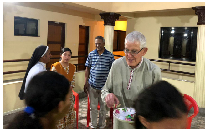
The SEE result of SXG 2076

We had very good Secondary Education Examination (SEE) result.